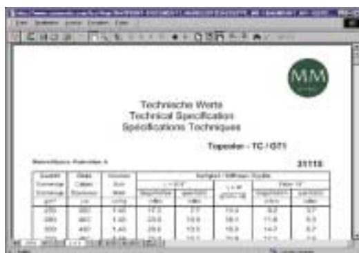
Technical Specifications as PDF files for Downloading